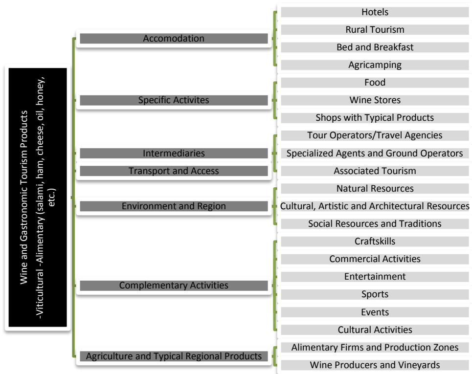
Figure 3. Supply components of wine and culinary tourism system (Karim, 2006).

Not only local food or destinations itself are used but also restaurants are one of the elements in gastronomy tourism marketing (du Rand et al. , 2003; cf. Horng & Tsai, 2010). The well-known chefs and internationalization helped the restaurants to attract tourists (Henderson, 2009). Today, these restaurants make a touristic destination popular (Lin, Pearson & Chai, 2011). In restaurants how, where, when and why we eat and drink it is important to customers. Not only the design and the preparation but also the knowledge of how the meal to be consumed is also important (Harrington, 2005). Thus, Correira et al. (2008) states that restaurants have to be careful about the importance of themselves. In other words, the preparation and ethnic ingredients are not enough, also the dining experience started to gain importance. Yet, Jacobsen & Haukeland (2002) found that the tourists' restaurant selection criteria depend on the physical conditions and the ambiance of the restaurant, the quality of the food and the service quality and the friendliness.